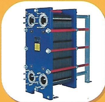
Plate heat exchanger