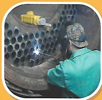
Boiler Tube welding