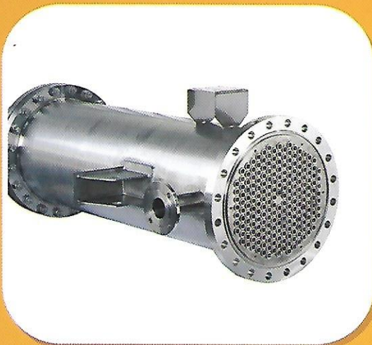
Steam Heat exchanger