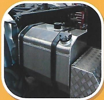
Aluminium Diesel Tank