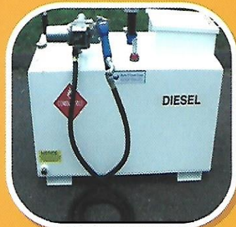
Double Layered Diesel Tank