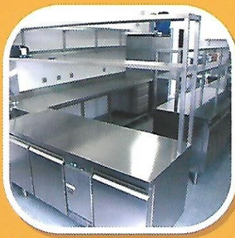
Stainless Steel Fabrication